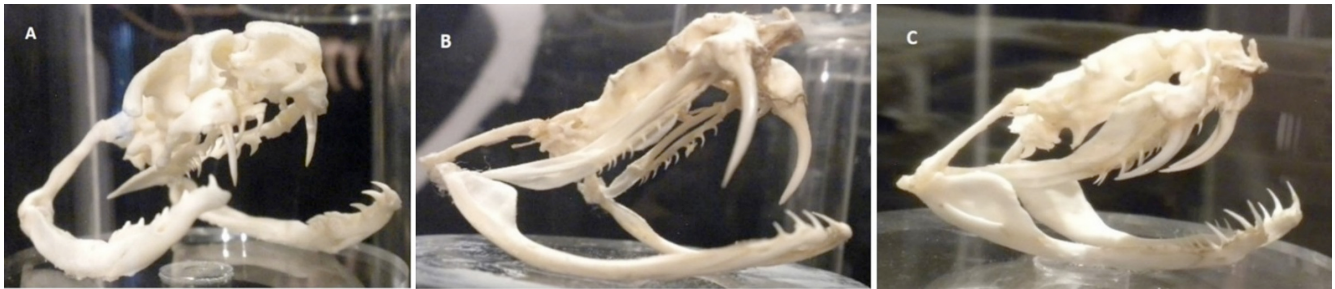
Fig 1 | Difference in fangs between elapids and viperids. A) Elapids have short, fixed, front fangs. B&C) Vipers have much longer and retractable front fangs.

Some snakes with fangs towards the back of the mouth (“non-front-fanged colubroids” such as African boomslang and vine snakes, South American racers, and Asian yamakagashis) and the burrowing asps (or stiletto snakes) whose unique jaw kinesis coupled with exceptional neck flexure allow for a single protruding fang to be jabbed sideways or backwards, can also cause envenoming. 3 28 29 Spitting cobras and rinkhals can eject venom over several metres, often delivering venom droplets into the eyes of the animal or human perceived to be a threat. 30–32